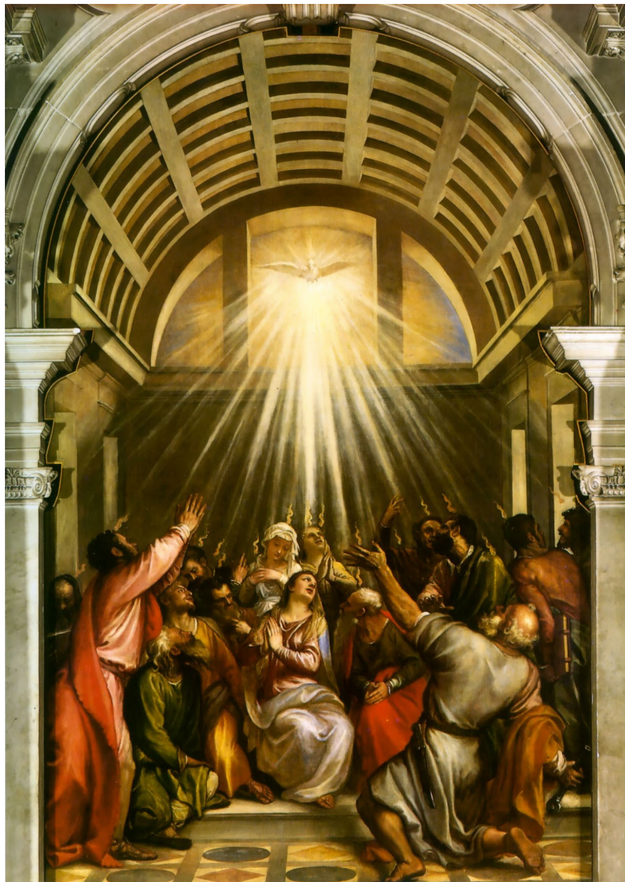
Pentecost, by Titian, 1545